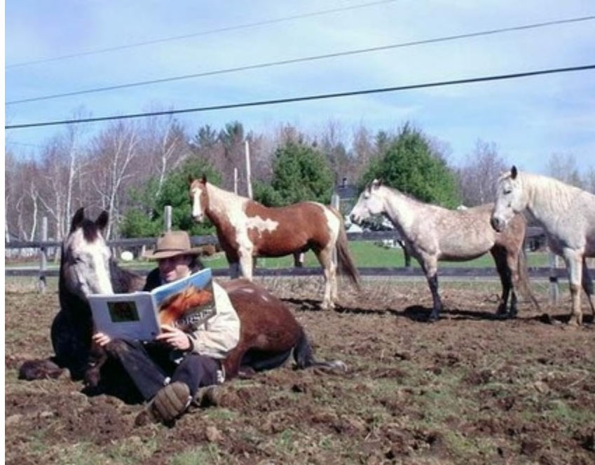
The Big Book of Horses - our favorite

I was raised in the English language in French-speaking Quebec. My father's side came from Italy; my mother's from Ireland. I work in Spanish and dabble in German and Russian. Recently, someone asked me what language I speak best. Thinking for a moment, I sighed to myself as the answer that silently came to my mind was, 'Horse'.